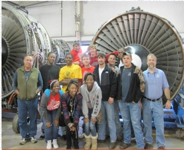
Rivercrest HS students tour the Arkansas Northeastern College Aircraft and Metals Engineering Center