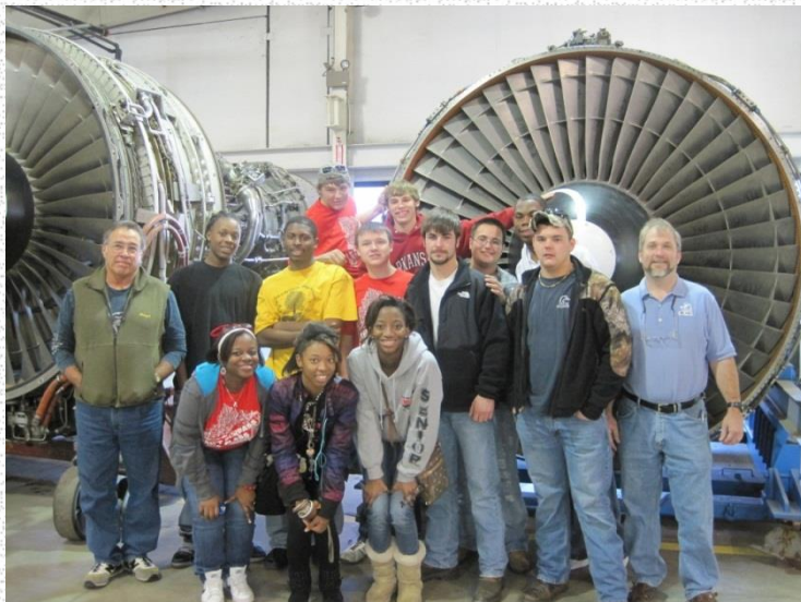
Rivercrest students tour the Arkansas Northeastern College (ANC) Aircraft and Metals Engineering Center