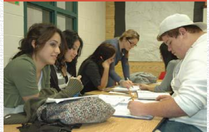
Hall HS students at the Academic Year ACT Academy